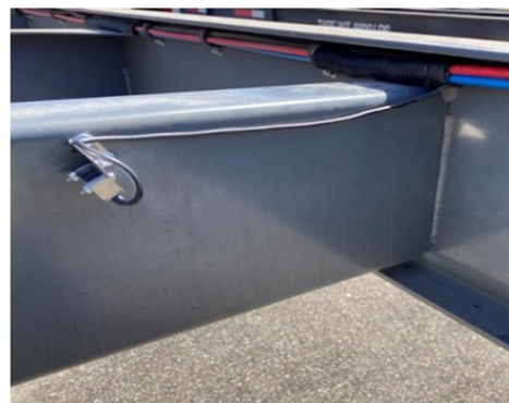
SEN01-LAS at 45-degree angle